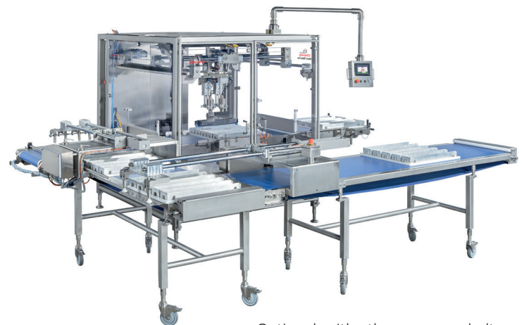
Optional: with other conveyor belts